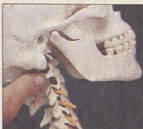
An adjustment of the C-1 vertebra helped reduce blood pressure in hypertensive patients in a recent pilot study.